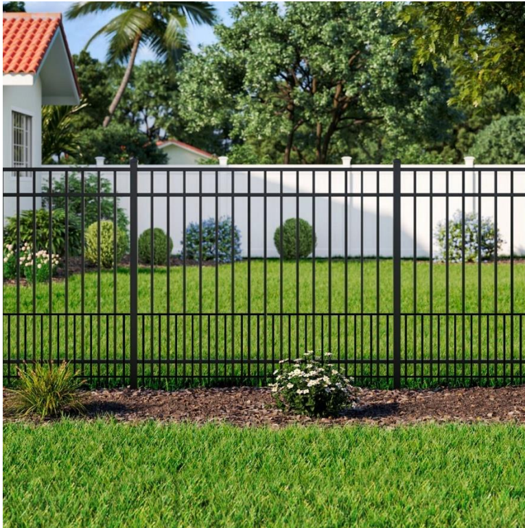
Figure 1 Example of fence with “puppy guard.”

Another option would be to add more square metal tubing in between existing fence (i.e. puppy bars/guard) up to 36 inches. New fence addition must be maintained, neat and level throughout.